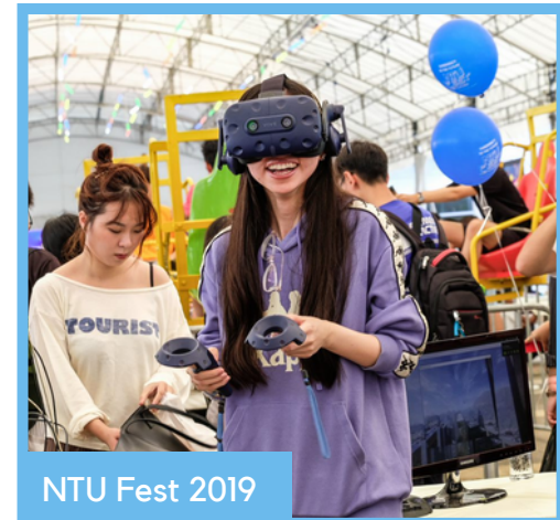
NTU Fest 2019