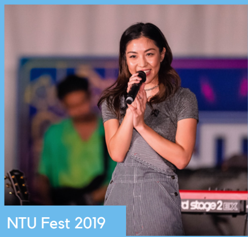
NTU Fest 2019