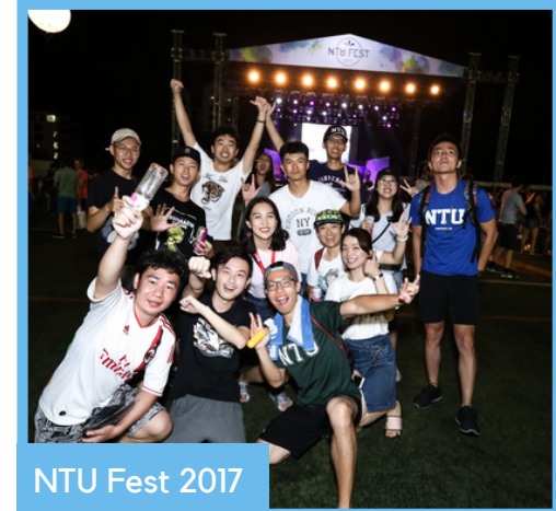
NTU Fest 2017