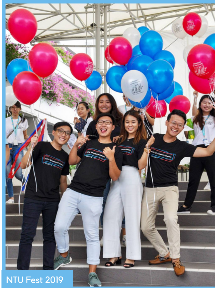
NTU Fest 2019