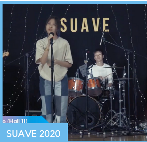
(Hall 11) SUAVE 2020