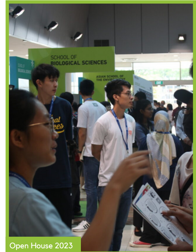
Open House 2023