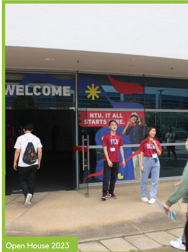
Open House 2023