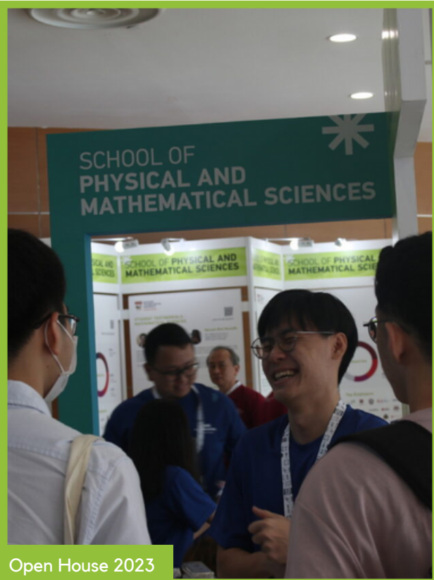
Open House 2023